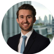
Senior Portfolio Manager