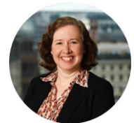
Senior Portfolio Manager