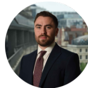
Multi Asset Strategist & Portfolio Manager