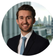
Senior Portfolio Manager