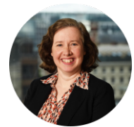
Senior Portfolio Manager