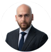
Head of Portfolio Management and Asset Allocation