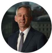
Group Chief Investment Officer