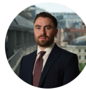
Multi Asset Strategist & Portfolio Manager