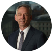
Group Chief Investment Officer