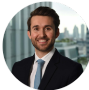
Senior Portfolio Manager