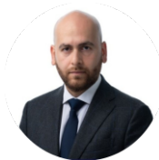
Head of Portfolio Management and Asset Allocation