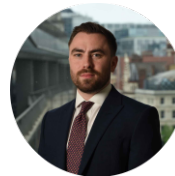
Multi Asset Strategist & Portfolio Manager