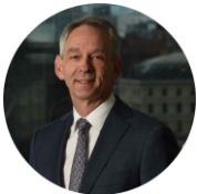
Group Chief Investment Officer