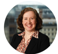
Senior Portfolio Manager