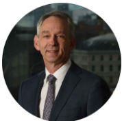
Group Chief Investment Officer