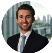
Senior Portfolio Manager