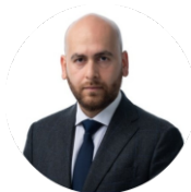
Head of Portfolio Management and Asset Allocation