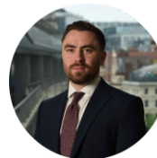
Multi Asset Strategist & Portfolio Manager