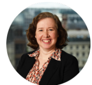
Senior Portfolio Manager