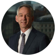
Group Chief Investment Officer