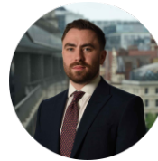
Multi Asset Strategist & Portfolio Manager