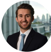
Senior Portfolio Manager