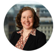
Senior Portfolio Manager