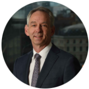
Group Chief Investment Officer