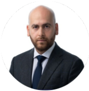
Head of Portfolio Management and Asset Allocation