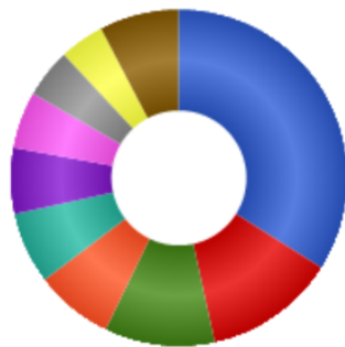
EPIM Cabot Global Equity