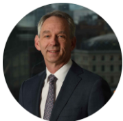
Group Chief Investment Officer