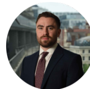
Multi Asset Strategist & Portfolio Manager