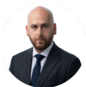
Head of Portfolio Management and Asset Allocation